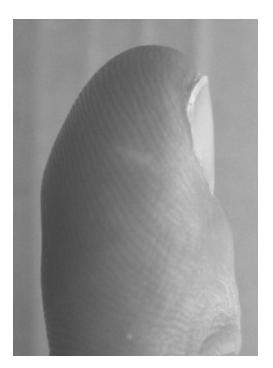
Figure 161. A flat nail is level and horizontal, without any hollow or bump.

A flat nail indicates that we are overly isolated in our own way of thinking and doing. Some fire is mis-