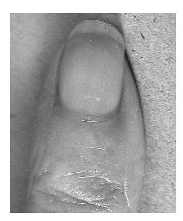
Figure 157. The long and narrow nail is small in width in comparison to its length.

actualize these ideas. Unlike the self-reliant broad nail individual, we are more affected by the atmosphere of the environment around us. Consequently, we can easily feel anxious if we do not feel support from our environment according to our idealistic vision. As our narrow nails are restricted in width-related Mars, we lack the energy to embrace others' ideas and, consequently, can feel confined and limited in our outlook.