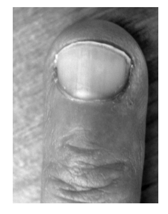
Figure 159. Short nails are inclined to be squarish, and small in both length and width.

Short nails provide inadequate protection for the nerve endings in our fingertips. Imagine if we were knights of old entering battle with a small or defective shield. We would not feel safe, secure or confident. Stripped of our armor, we would feel ex-