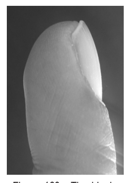
Figure 160. The ideal height of a nail is slight-ly raised.

The ideal height of a nail is slightly raised and it follows the curvature of the top phalange (Fig. 171). It is a positive sign that reflects sensitivity and enthusiasm. We are amiable with a flexible attitude. We have good circulation.