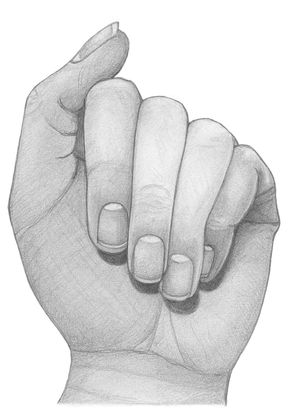
Figure 152. Nails are the thin horny covering that grows on the upper surface of the end of each finger.

The nails act as our interface with the world. A study of the nails reveals the degree to which the brain and the nervous system are protected. For exa mple, small or bitten nails remove the nerves' protective covering, just as stripped insulation leaves exposed live wires.