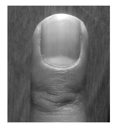
Figure 156. The broad nail covers a wide area of our fingertip.

The broad nail covers a wide area of our fingertip (Fig. 167). It allows for expanded nerve endings